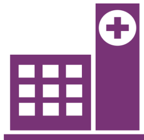
Arriving at A&E

Fantastic work is happening across London to help people stay at home as much as possible – and come home as soon as possible if they do need to be in hospital