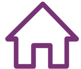
Out of hospital and back home

People are being seen in in A&E more quickly – particularly when compared with last year