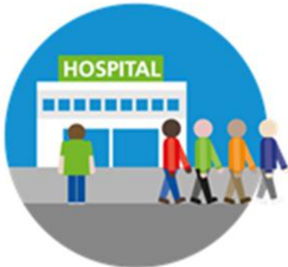
Hospital admissions for asthma (under 19 years), London LAs, 2014/15

Second worst performing Borough in London (14/15)